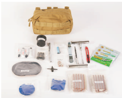
No.2 tire repair for tires and without hose