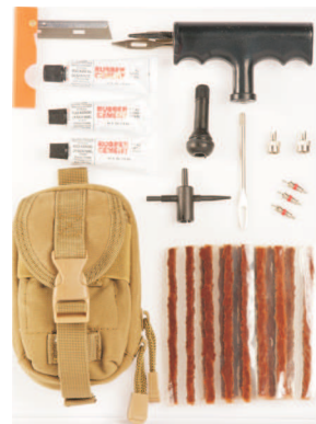
No.1 tire repair for tubeless mature

Portable compressor kit available with Extreme Aire or Extreme Aire Magnum