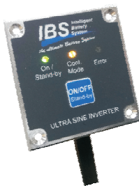
Remote control RPi03 for USi80/160

Inverter Applications: 4WD, maintenance and emergency vehicles, police, mobile homes, mountain huts, telecom stations, coaches, mobile café machines.