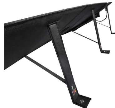
SK120 with integrated feet

Flexopower Energies (Pty) Ltd, Johannesburg, South Africa